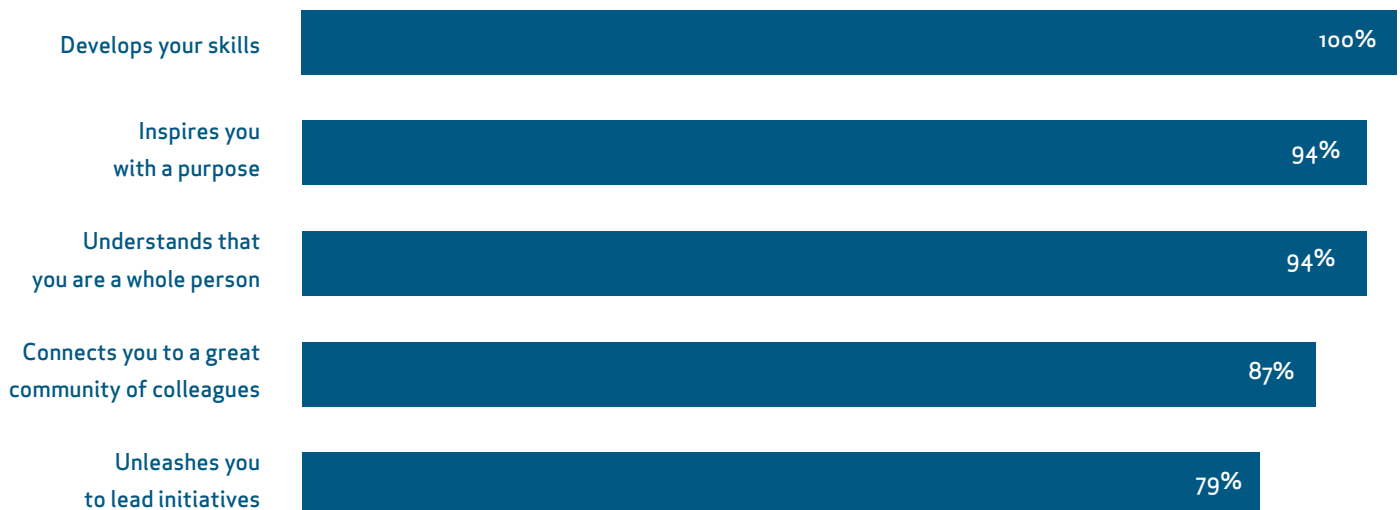
Figure 2. Why Millennial Women Join, Engage in, and Stay with Organizations: In our survey, young women were clear about what's important to them at work. How important is it to you that your organization ...

By implementing strategies and programs informed by the needs of millennial women, leaders will simultaneously be addressing what matters most to broader talent pools.