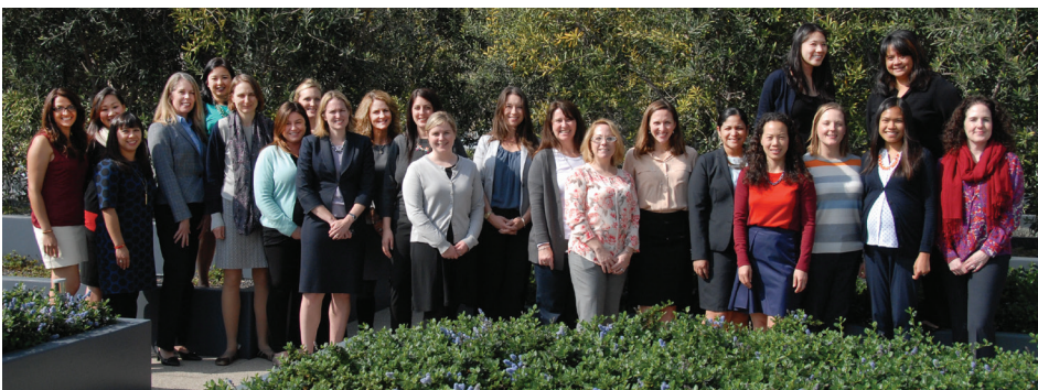
Image 1: Women in BlackRock's Art of the Ask Alumni Network

Continuing to expose bright, young women to stretch assignments is vital for retaining female talent, especially once they are 5-10 years out of university. As one woman explains, "At my company, we've definitely seen the challenge where people will come in out of school and their career will accelerate. They thrive on stretch assignments for a while and then somewhere around their mid to late 20s something happens. That pace of new projects is either no longer enough or it levels off. Women have left because they hit a plateau."